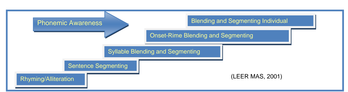
The Spanish Phonological Awareness Continuum