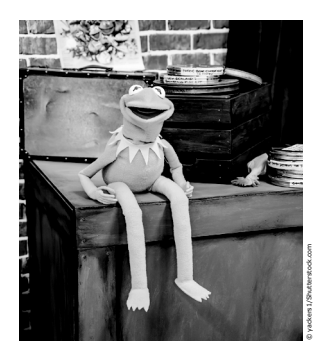
Kermit the Frog is a kind character.