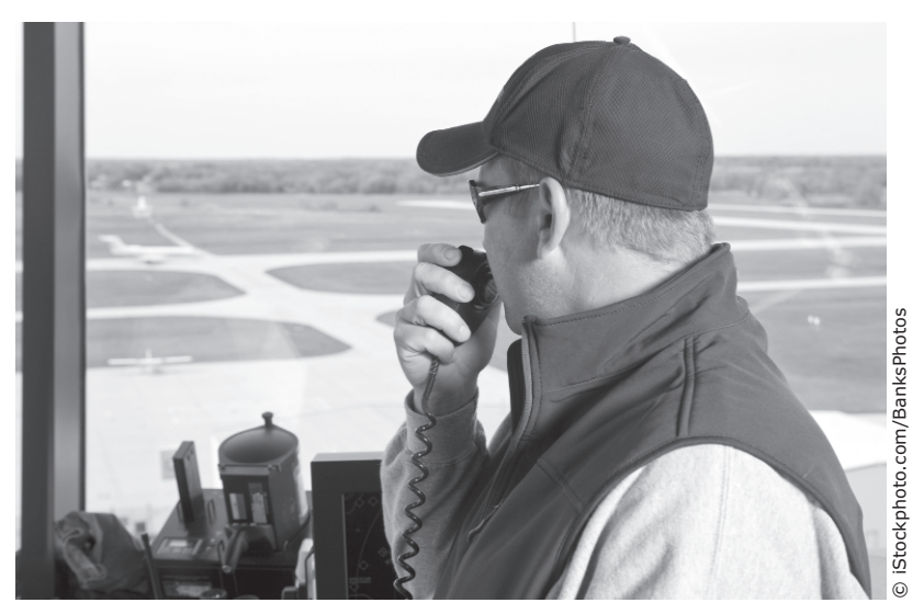
An Air Traffic Controller Talking to a Pilot Landing a Plane

(18) Eventually you'll begin to get close to your destination, and the responsibility for your plane will be handed back over to a local control tower.(19) There, controllers will be ready to make sure that our plane lands in an orderly fashion.