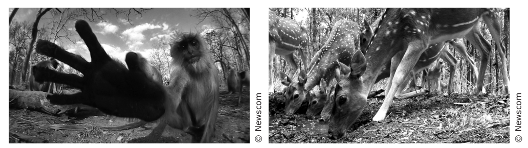
Real Images Captured by Elephant Cameras

(20) Clearly, the jungle animals were not afraid of the elephant cameras. (21) As a result, the elephants were able to film creatures that are often leery of people. (22) Curious monkeys reached out for the tusk-cams deer stood still and allowed the cameras to film them. (23) Jungle mothers let the elephants get very close to their babies.