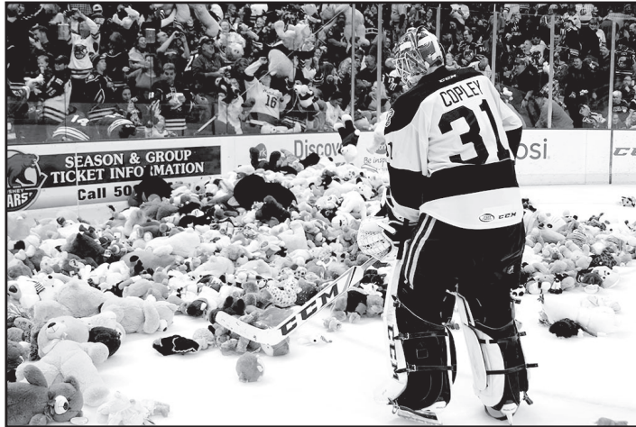
A Member of the Hershey Bears Hockey Team Looking at all the Teddy Bears on the Ice