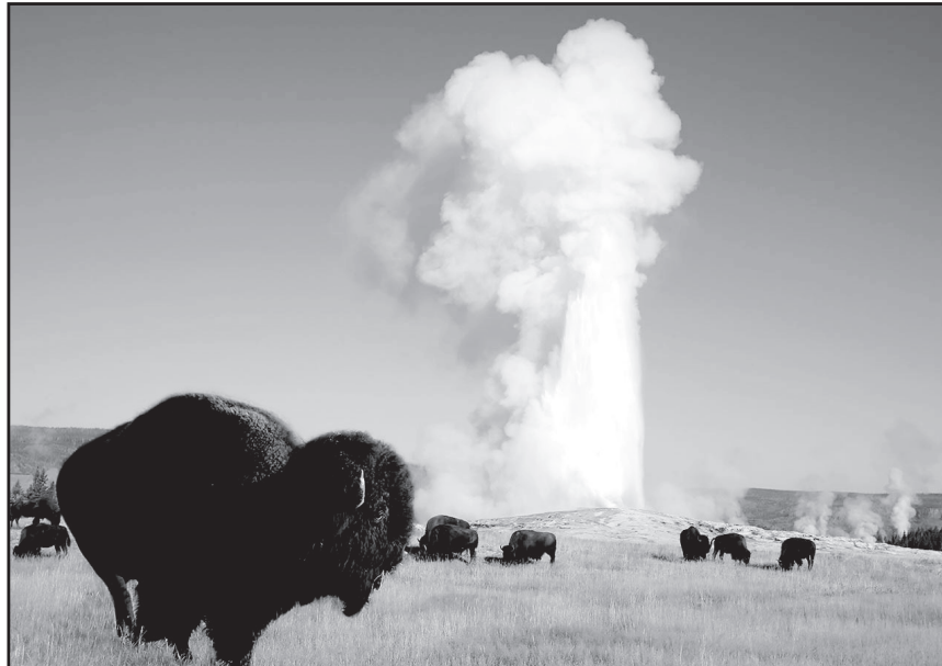
Bison Herd with Old Faithful Geyser Erupting