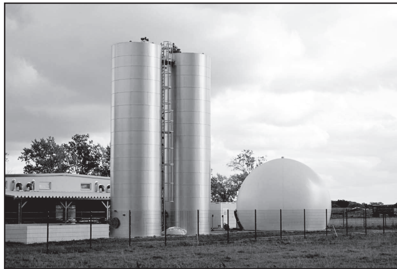
Anaerobic digester silos trap methane gas.