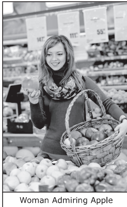
Woman Admiring Apple