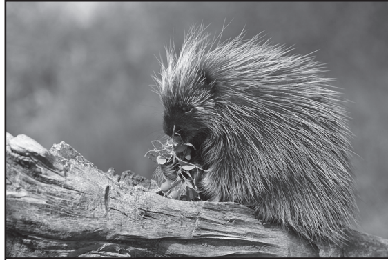
A porcupine is eating leaves while sitting on a tree branch.