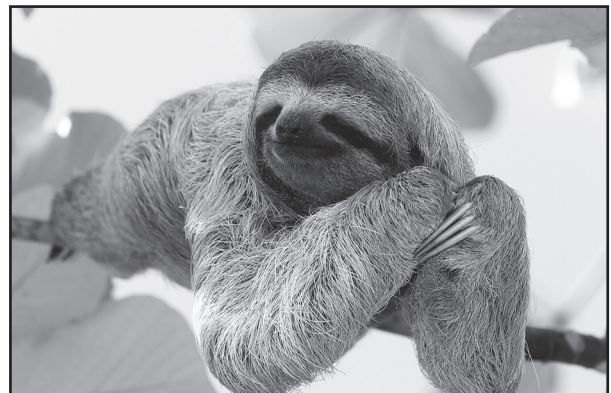
A sloth rests on a tree branch.