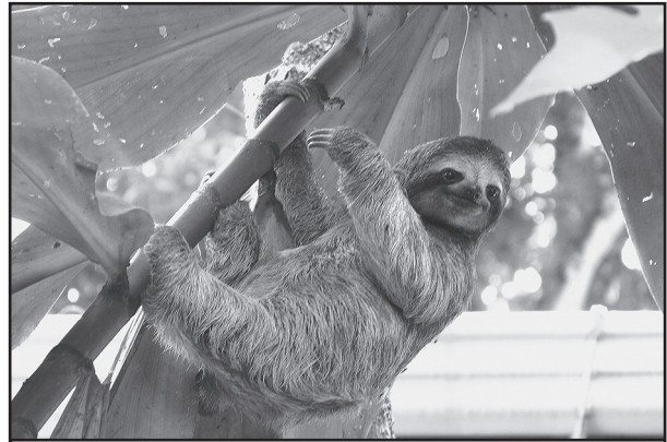
A sloth hangs out in a tree.