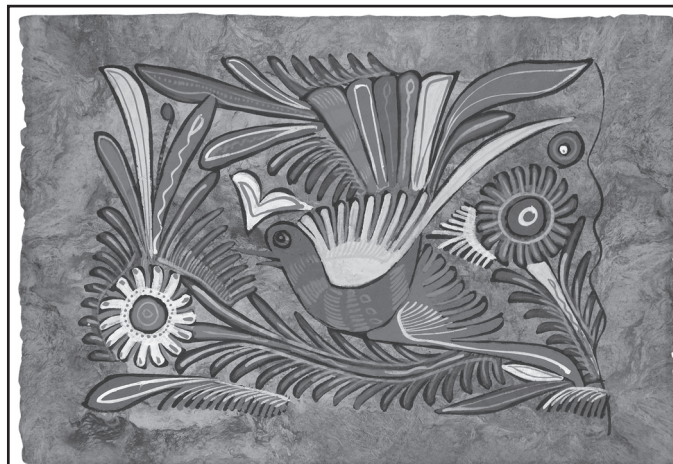
A Bird and Flowers Painted on Amate Paper