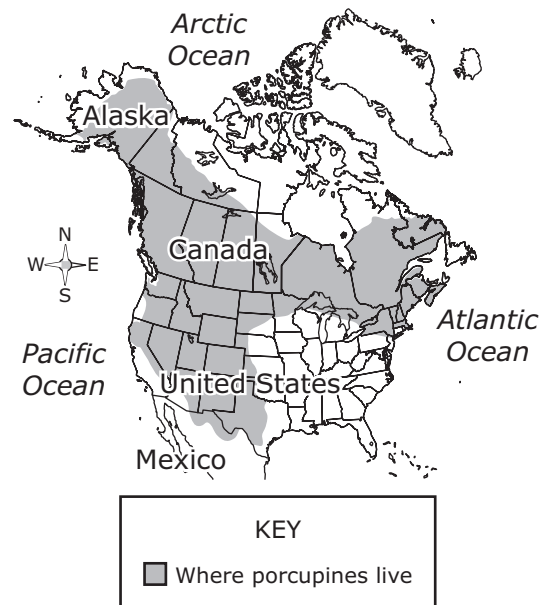
Porcupines in North America