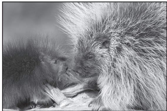
Porcupine Mother and Baby

7 At first, their quills are soft and wet. But in just a few hours, the quills dry out and become stiff little stabbers. They aren't long enough to hurt a predator, though. So if a baby feels threatened, it quickly finds a place to hide.