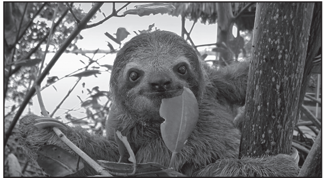
A sloth munches on a leaf.