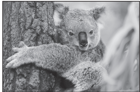
A Koala Hugging a Tree

1 There's something about the sight of furry koala bears—they look so cuddly, you just want to give them a hug. Of course, koalas don't hug . . . or do they? Recently, during an extreme heat wave in Australia, scientists noticed something unusual. As the temperatures rose, koalas high in the eucalyptus trees climbed down from the treetops. Then they spread out on lower tree limbs. It looked as if they were embracing the trunks. But why would koalas hug trees?