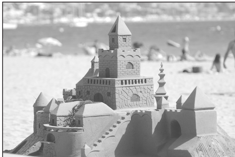
Sandcastle on a Public Beach

3 Some people think that all that is needed to build a sandy masterpiece is a plastic bucket and a shovel. But building an expert sandcastle really requires patience and attention to detail, as well as the proper tools. Some sandcastle builders are actually professional sand sculptors. They have mastered their art through practicing and learning from other sand sculptors. The tricks these sculptors know can help anyone build a better sandcastle.