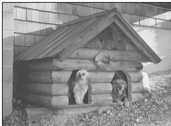
A Log-Cabin-Style Doghouse