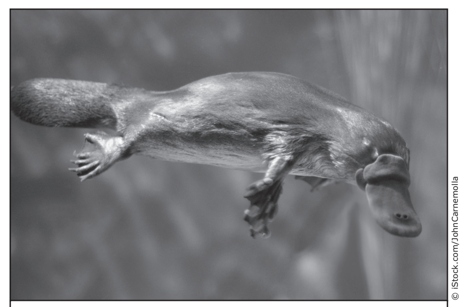
The platypus spends a lot of the day in the water.

In Australia there is a small, furry, brown animal that lives in lakes, rivers, and streams. It looks a bit like an otter but appears to have a duck's bill and a beaver's tail. When it walks on land, it waddles from side to side like a large lizard. The platypus is so odd looking that the first time English scientists saw it, they thought someone was playing a trick on them.