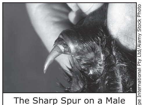
The Sharp Spur on a Male Platypus's Leg