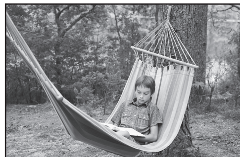
Relaxing in a hammock is a favorite pastime of many people.