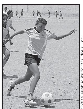
A Pumpkin on the Attack