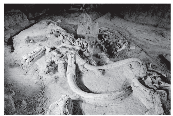
Mammoth Fossil at Waco Mammoth National Monument