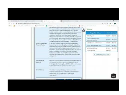
Click the image above for video instructions on how to access the budget object code amounts in your web-based TIP

Remember that all campus funding must be within budget. As budget object code budget amounts are reviewed, ensure no budget object code or total budget is 'overspent.'