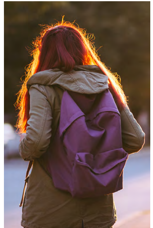
Copyright © 2020. Texas Education Agency. All Rights Reserved.