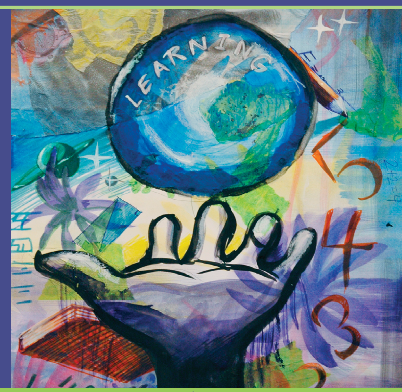
A Report to the 81<sup>st</sup> Texas Legislature by the

Office for Planning, Grants, and Evaluation