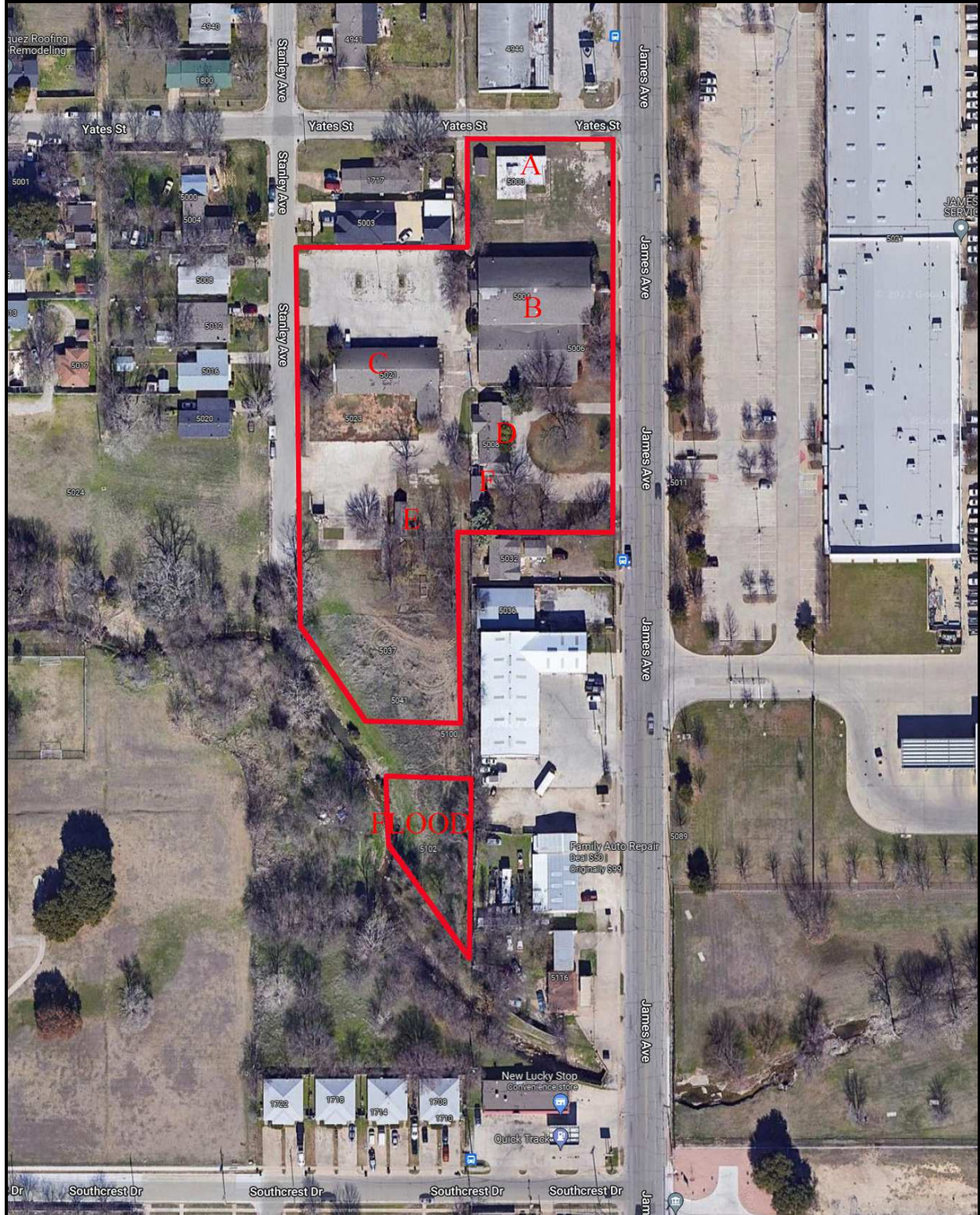
Boundary As Reported by County Tax Assessor.