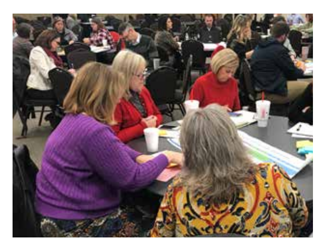
STEM and Work-Based Learning Tour, ESC Region 14

Texas has a regional education support system for LEAs called Regional Education Service Centers (ESCs). The support services and technical assistance ESCs provide to LEAs enables LEAs to operate more efficiently, implement legislative and commissioner initiatives, and assist in improving student performance. ESCs are funded through state, federal, and school district grants and contracts. Twenty independent ESCs provide services to school districts throughout the state. The ESCs are service organizations, not regulatory arms of the Texas Education Agency, and LEA utilization of ESC services is voluntary.