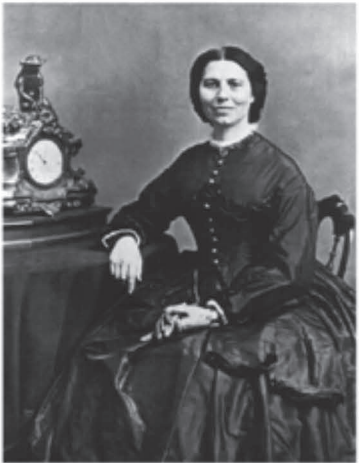
Historical Photo Services