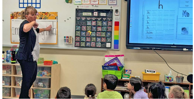
▲ Italy ISD

Teaching is one of the most rewarding professions, but it is also highly demanding. A teacher must develop skills specific to teaching, such as classroom management, that require intensive study, training, and practice. Furthermore, a skilled teacher must excel in their subject matter. Texas allows many different pathways for those interested in becoming a teacher, but not all pathways provide the same level of preparation.