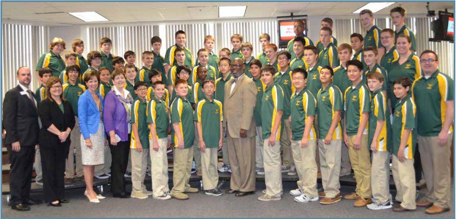
The Young Men Junior High School Choir, Young Junior High School in the Arlington ISD, performed at the April 11 State Board of Education meeting.