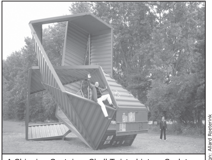
A Shipping Container Shell Twisted into a Sculpture

6 With all these options and new purposes, fewer shipping containers will be headed to the junkyard. They have been broken out of their traditional boxes and are having their utility extended with new forms and function.