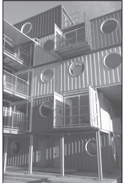
A Building Constructed from Shipping Containers