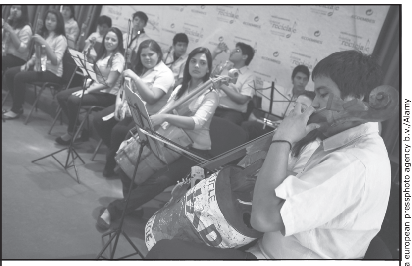
The Recycled Orchestra plays in Madrid, Spain.