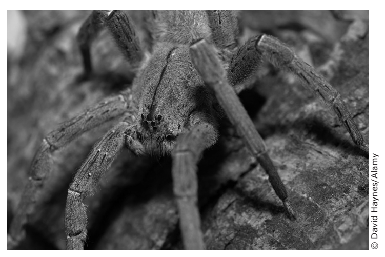
Brazilian Wandering Spider

is threatened. (12) An attack by this spider could be more than just excruciatingly painful, it could be fatal.