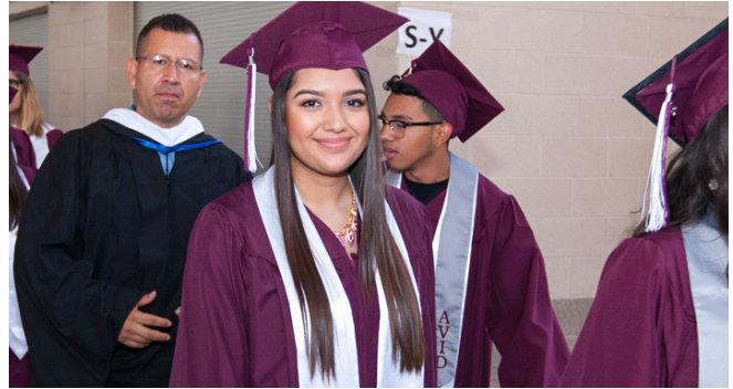
▲ Fort Worth ISD

Preparing students for life beyond high school is vital for their economic future and the growth of the state, as most jobs require some education and training beyond high school. HB 8 (88R) created an incentive for colleges to partner with school systems to help students earn 15 hours of college credit in high school. The Legislature also provides incentives to transform certain traditional high schools into specially-designed college and career readiness schools to maximize the postsecondary success of students.